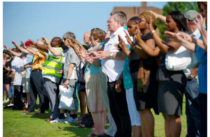
“There is multiplied power in united prayer.” Patron: Evangelist Reinhard Bonnke